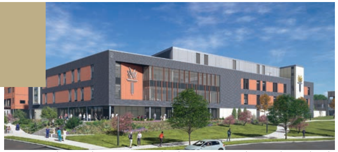
Perry Family Simulation Hospital adjacent to WakeMed in Raleigh

Looking west, plans are also moving forward for Wake Tech's new Conlon Western Wake Campus in Apex. Slated to open in 2030, the campus will sit alongside the future North Carolina Children's Hospital and a rapidly expanding biopharmaceutical corridor. With programs in biotech, health sciences, business, IT, and university transfer, the campus will help ensure Wake Tech reaches students in every corner of Wake County, and rallies around them to go as far as their dreams, talents, and resilience take them.