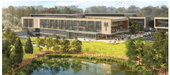
Wake Tech's new Conlon Western Wake Campus in Apex