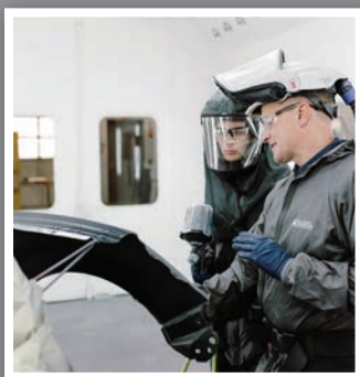
Sandhills Community College Collision Engineering Career Alliance is designed to prepare students for successful careers in the collision repair industry.

North Carolina’s Community College System is a powerful partner for businesses across the state, offering workforce solutions designed to drive growth, innovation and competitiveness. With 58 colleges strategically located throughout North Carolina, nearly every employer has convenient access to high-quality training, education and support services tailored to meet evolving industry demands.