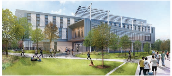
Advanced Technology Center at the Eastern Wake Campus