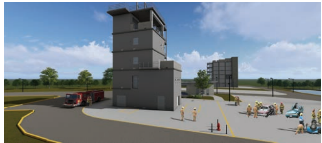
The Fire and Rescue Training Center at Eastern Wake Campus