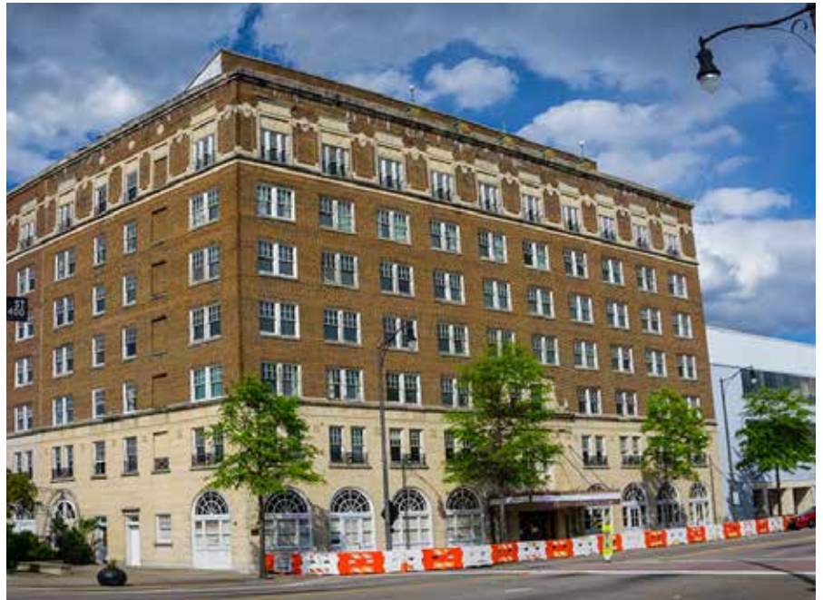
The transformation of the Prince Charles Hotel is a major feature of Fayetteville downtown revitalization.

Overall, according to the FCEDC, the majority of vacant industrial sites have seen interest in the last 12 months, with the agency responding to 74 requests for information from