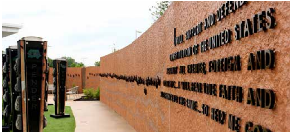
Fayetteville's downtown is undergoing a renaissance, top, while the community's long military partnership is showcased in its war memorial, bottom.