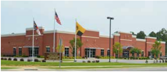
Collision U's building includes a lab, body shop and modern equipment.