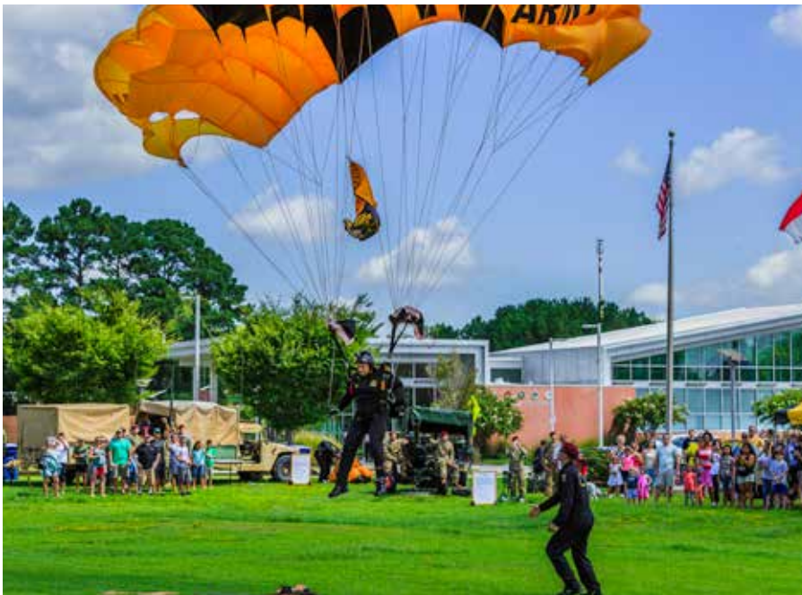
Fort Bragg is a central player in the Cumberland County community.