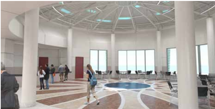
Fayetteville Regional Airport serves a 12-county area in southeastern North Carolina.

Cape Fear Valley Health System, based in Fayetteville, serves a seven-county region of southeastern N.C. In its 60-year history, its services have grown to include cardiology, obstetrics and gynecology, diabetes