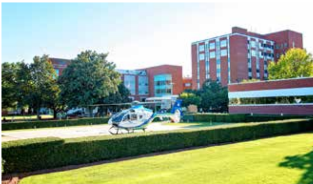
Cape Fear Valley Health System has made big investments to provide health care throughout the communities it serves.

In 2017, Cape Fear Valley launched five new medical residency programs, making a significant investment