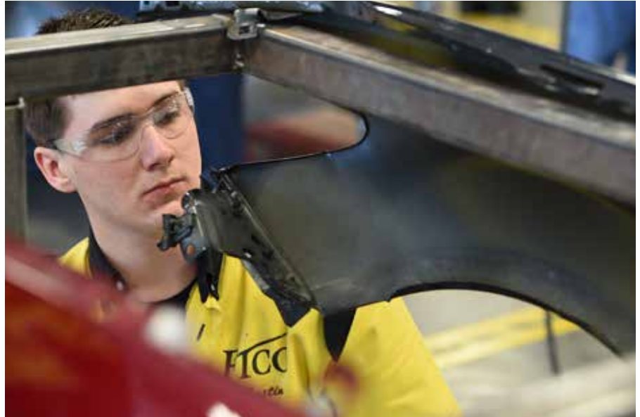
Fayetteville Technical Community College's auto-repair curriculum is partnering with businesses to produce uniquely qualified workers.

"It has grown into something significant, where we've had a number of